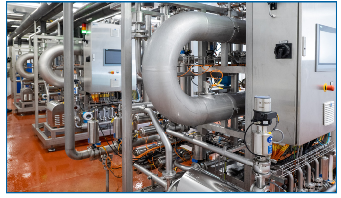
Pentair Smart BMF Beer Membrane Filtration Systems

What is next for Greene King? There is a five-year investment plan being developed to secure the business continuity and environmental performance of Westgate.