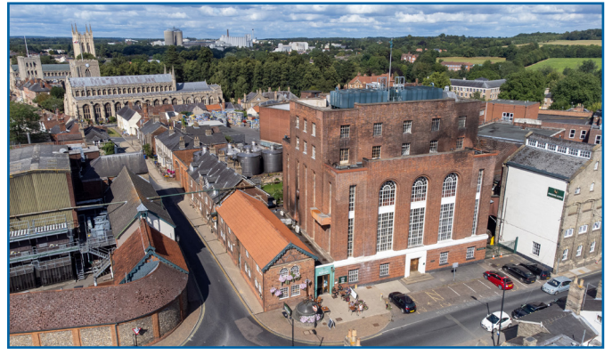
Greene King Brewery in Bury St.Edmonds, UK

As befits a brewer that traces its origins to 1799, Greene King Brewery is skilled in the art of blending the old and established with the new and innovative. Nowhere is this truer than at its Westgate brewery, with tried and trusted machinery and methods retained alongside installations of the latest technologies.