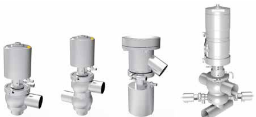
SVP Select Single Seat Valve Series

In both valve types the advanced seal technology supports all performance areas of the proven Südmö valve technology, including Südmö's minimized maintenance requirements and easy service handling.